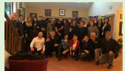
AHABA fundraiser in November 2019

Armenian Healthcare Association of the Bay Area 2500 Hospital Drive, # 4A Mountain View, CA 9404 Tel: 650-961-2013